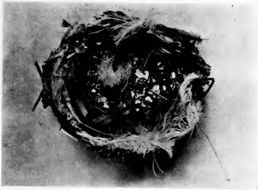
第五十圖 アマツバメの巢 (二分之一強實物大)